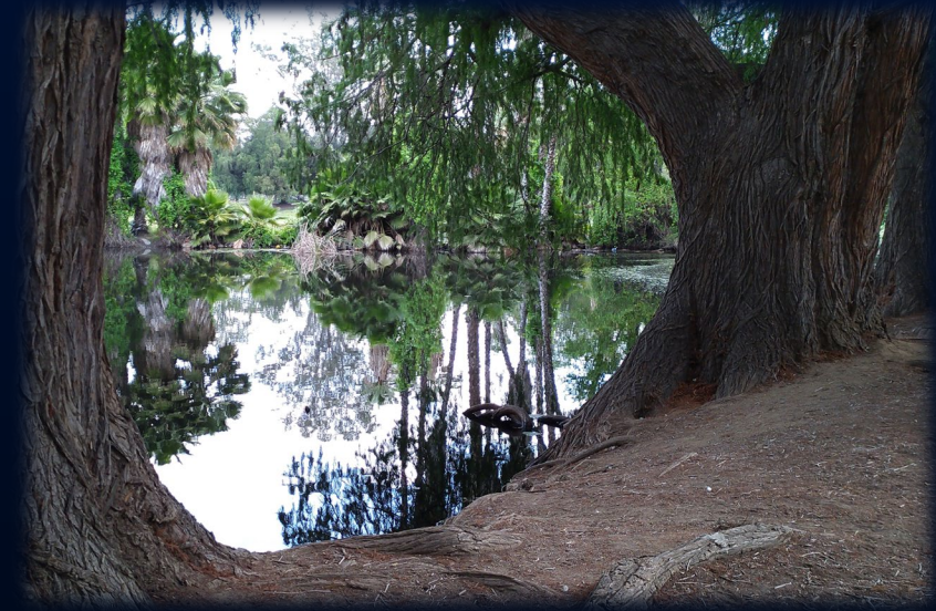
All Managed/Permitted by Riverside Film Commission and Inland Empire Film Permits: https://iefilmpermits.com/riversidecounty/