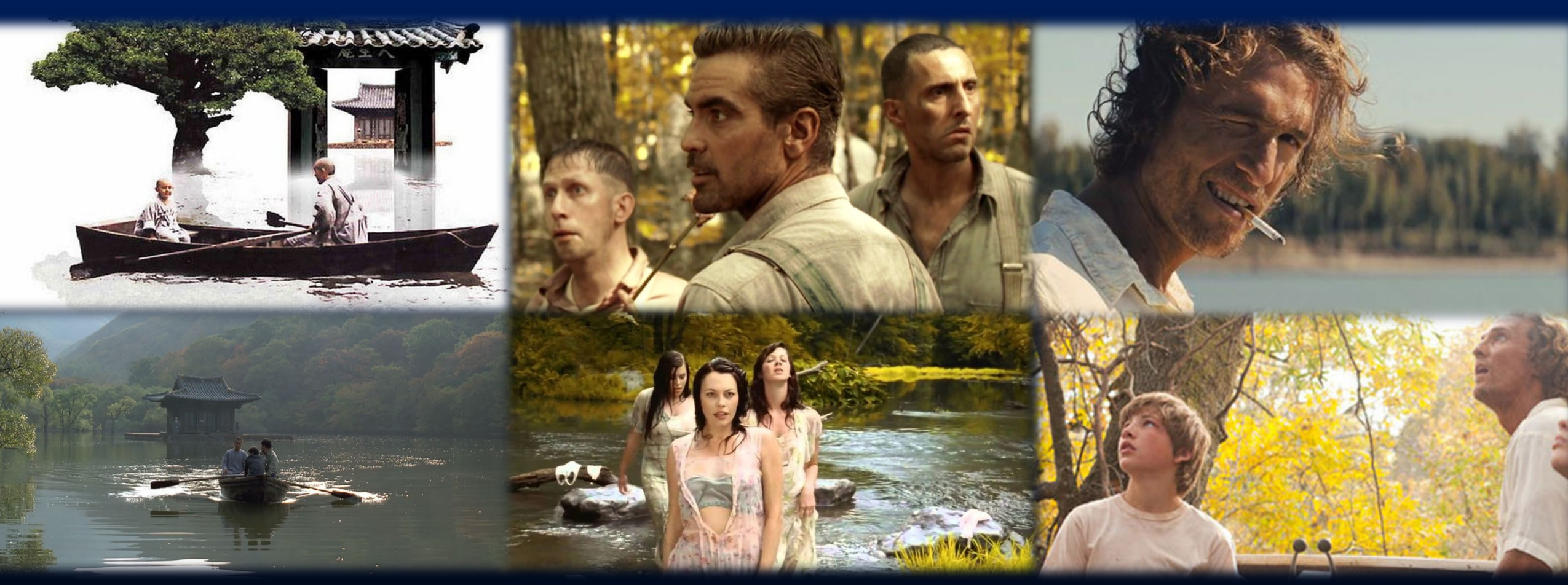
Spring, Summer, Autumn, Winter ...And Spring